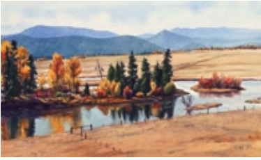
Janet Tarjan Erl Kimball State Park 18" x 24.5" $600