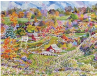
Kit Paulsen Psychedelic Autumn 29" x 34" $1200