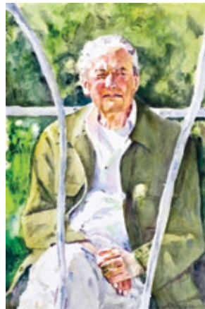
Kathleen D. Durdin Enclosed in Sculpture 29" x 22" $750