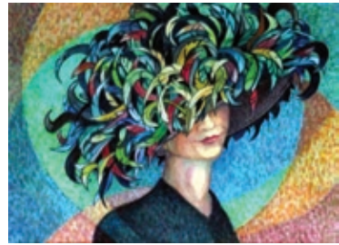
Charlotte Huntley This Old Thing 28" x 36" $3000