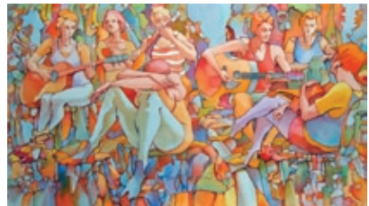
George Schoonover Backstage Dreamers 26" x 40" $3500