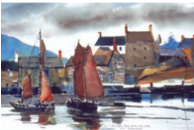
Roland Stevens Going to Market 20" x 26" $2600