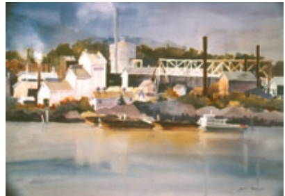
Betty Phillips Heyday 28" x 36" $800