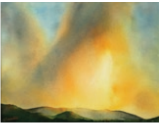
Glenyse Henschel Sky Lights 16" x 20" $245