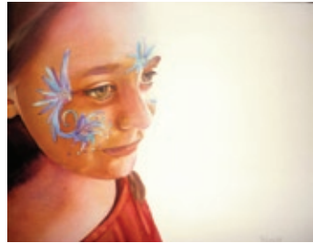
Sandrine Pelissier Face Painting 14" x 16" $800