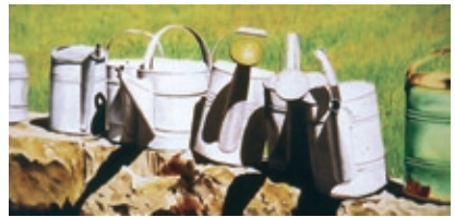
James R. Lefbvre Gossiping Gals 24" x 40" $1700