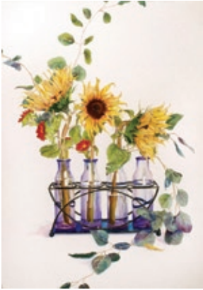
Terry Evers The Three Tenors 48" x 36" $5000