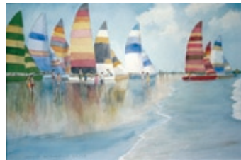
Philip Schnering Regatta 21" x 27" $600