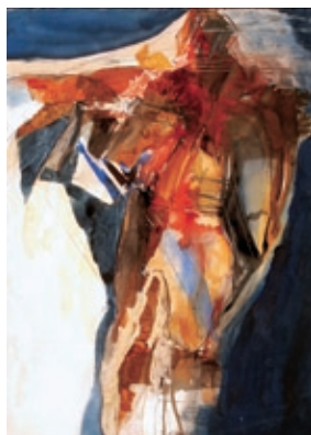
Joan C. Milsom Ultimate 36" x 28" $2000