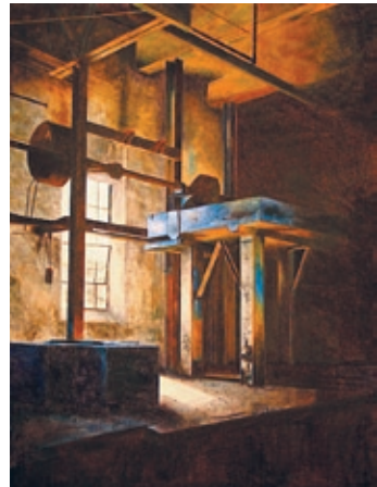
Robert Jenkins Illuminated 40" x 30" $2000