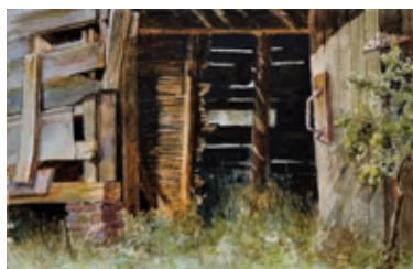
Tim Myrick Step Into Yesteryear 16" x 20" $2500