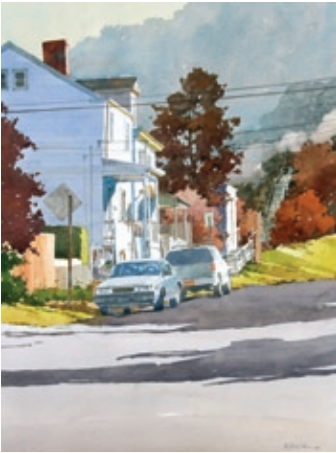
William M. Vrscak Houses at the Top 24" x 30" $1900