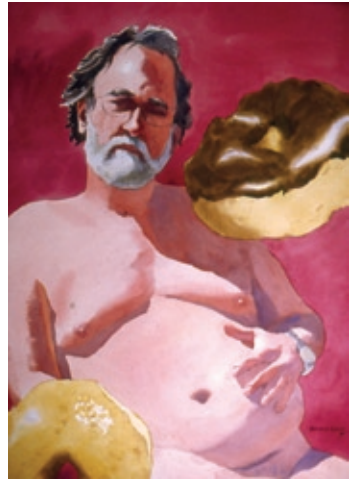
Howard Kaye Prevalence of Donuts #2 35" x 27" $2000