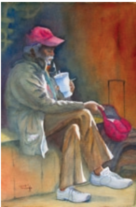
Roc Prologo Panhandler 30" x 28" $1250