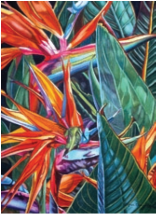
Missi Paul California Dreaming 31" x 39" $2000