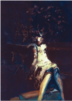
Sherrie Plonski 5 O'Clock Shadows 19" x 15" $600