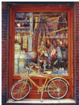
Eileen Mueller Neill A Visit to DeMiccoli 36" x 29.5" $4000