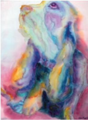
Sim Kun Cha Heavenly Thought 30" x 24" $4000