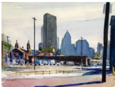
Calvin Lynch Late Afternoon 32" x 26" $1400