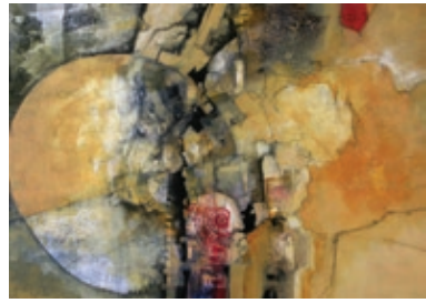
Barbara Yoerg A Sense of Loss 22" x 28" $800