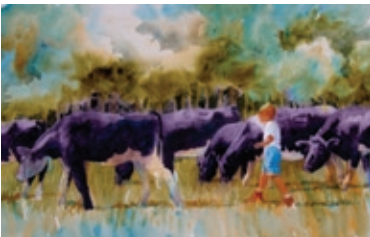
Suzanne Hetzel On The Mooove 21" x 27" $1000