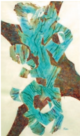
Gloria Stoll Karn Escape 33" x 23" $1200