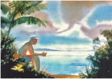
Kathy Sabbath Oravec Going to Market 20" x 26" $2600