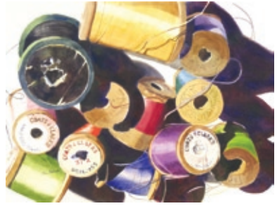
Esther Garfinkel Coats & Clark's 31" x 38" $1000