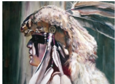
Sabina Turner Dream of Wolverine 32" x 39" $1400