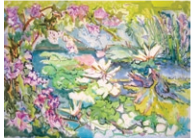
Van Wright Queen For a Day 28" x 36" $1000