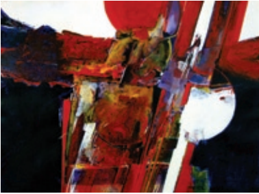
Denise Athanas Moonscape 30" x 38" $2000