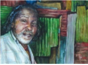
Suzanne Accetta Corrugated Man 16" x 20" $800