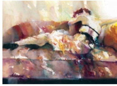
Nancy Deckant Resting 24" x 36" $2400