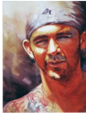
William Perry Israel #1 36" x 29" $2000