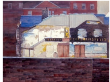
Leo Goode Urban Redevelopment 28" x 36" $1100