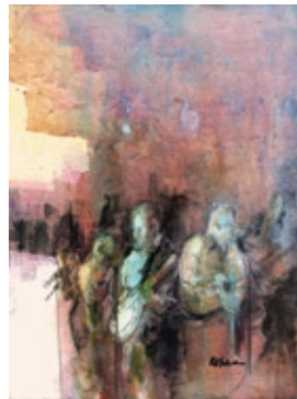
Robert Yonke The Other Side 19.5" x 25.5" $800