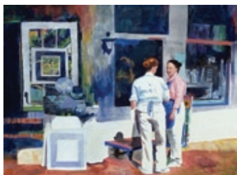
Susan Meyer Curiosity Shop 29" x 37" $1800