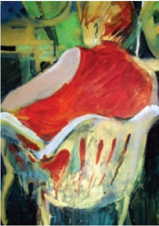
Sally Heston The Red Blouse 29" x 36" $800