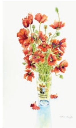
Karl R. Steinmetz Poppies in Beer Glass 36" x 28" $1200