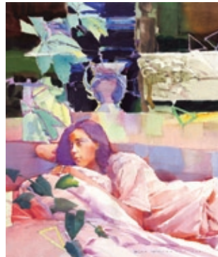
Ron Thurston Never Less 35" x 31" $1100