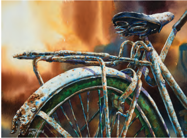
Lok Kerk Hwang , Batu Pahat, Johor, Malaysia Wheels No. 5 , $1,200 11" x 15"