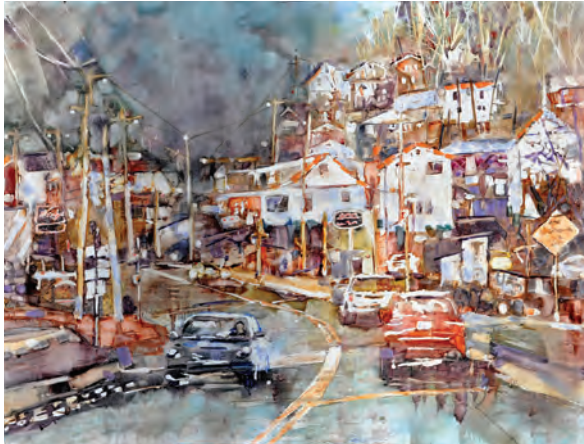
Eileen Sudzina , McKeesport, PA Storm Coming in Versailles $1,300 20" x 26"