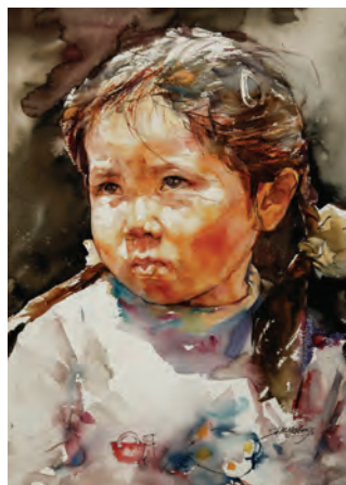
Hong Shan , Qingdao, China Lily $2,500 21" x 15"