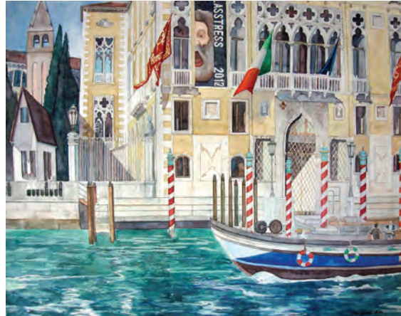
Margaret Sun , New York, NY Venice III $5,000 16" x 20"