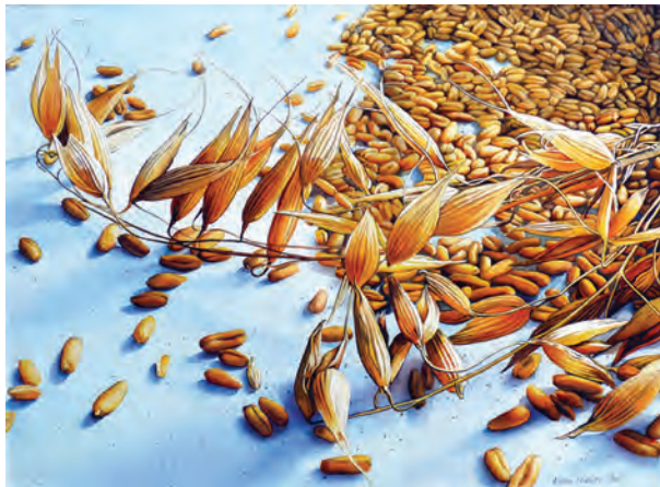
Eileen Mueller Neill , Riverwoods, IL Oat Groats $2,400 15.5" x 21"