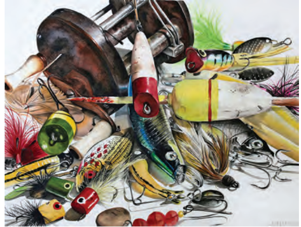
Lana Cease , Maryville, MO Alluring , $1,590 16" x 20"