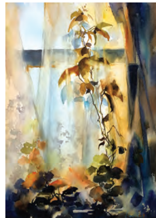
Sophie Rodionov , Yoqneam-Ilit, Israel Morning Through Curtains $800 20" x 14"