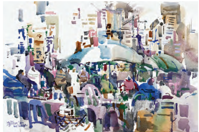
Woon Lam Ng , Singapore A Busy Morning @ Smith Street $4,800 15" x 22"