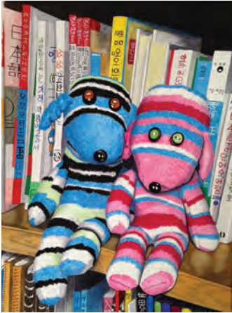
Randy Globus , Key Biscayne, FL Hearts & Minds , $2,500 40" x 30"