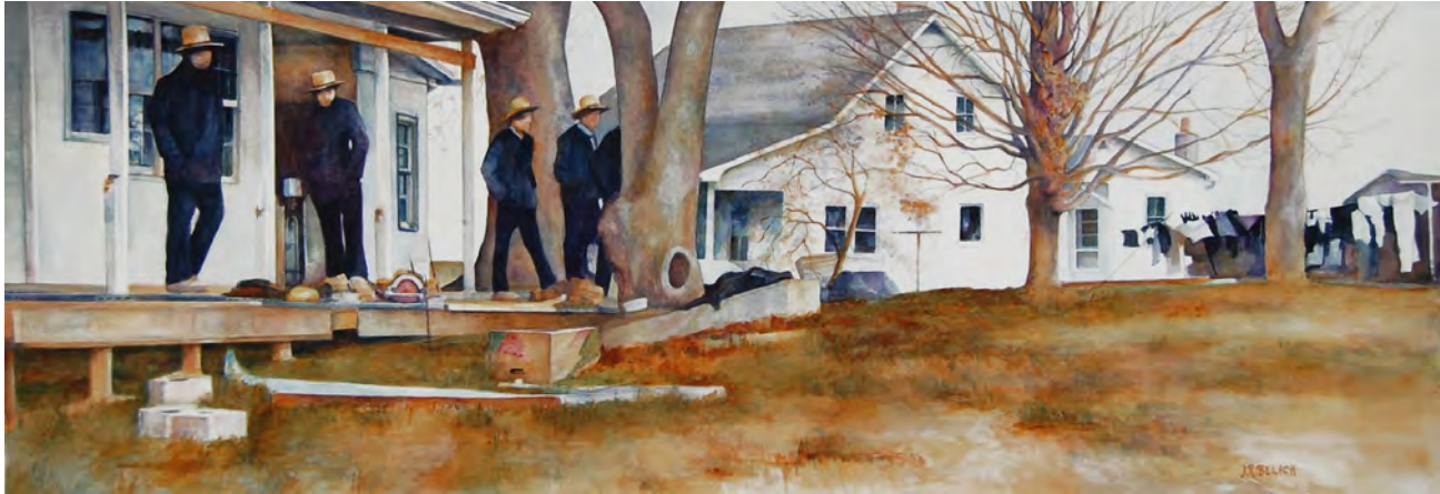
Janet Belich , Germantown, MD But Woman's Work is Never Done , $1,200, 12" x 30"