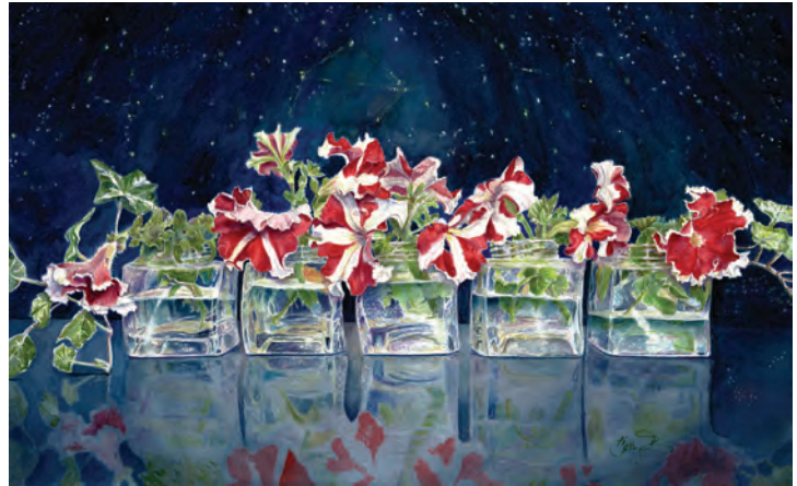
Terry Evers , Tucson, AZ Elysium , $5,000 18.5" x 30"