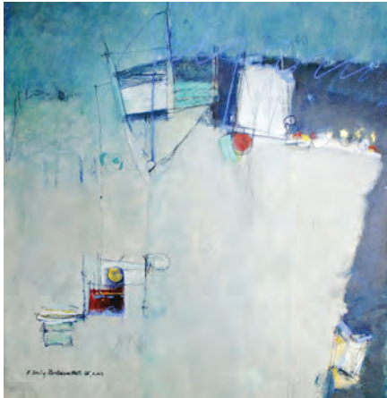
Elaine Daily-Birnbaum , Madison, WI The Illusion of Separateness , $3,600 23" x 22"