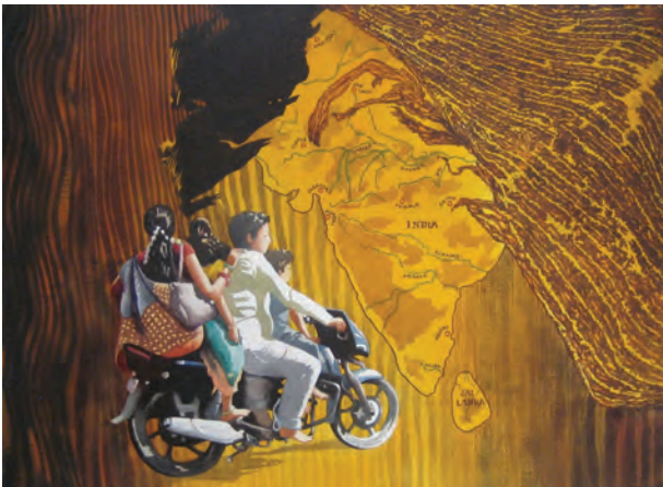
Carol Hubbard , Monroe, CT Day Trip , $2,500 28" x 36"