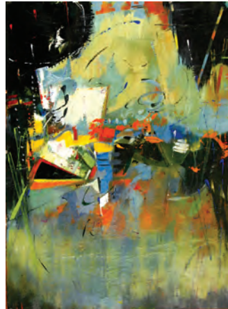
Denise Athanas , Mt. Pleasant, SC Sailing the Aegean , $3,800, 30" x 22"