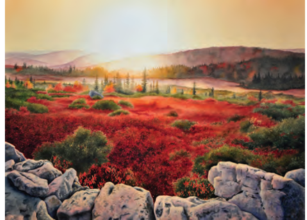
Michael McFarland , Mifflintown, PA End Light - WV $3,200 22" x 30"