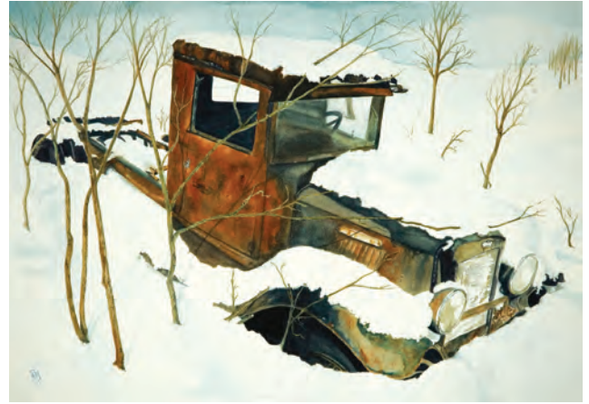
Joann DiNicola , Randolph, VT Sunbathing in Labounty Field , $850 13" x 19"