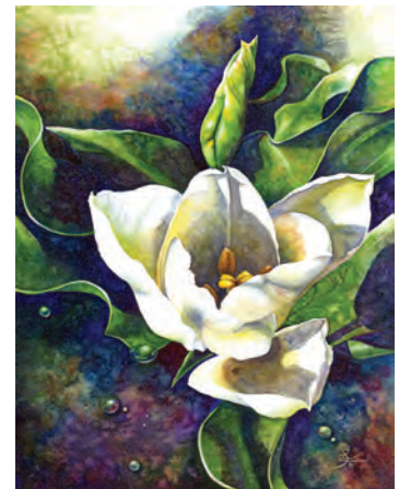
Sidra Kaluszka , Christiansburg, VA Emerging from the Darkness , $2,200 13" x 10"