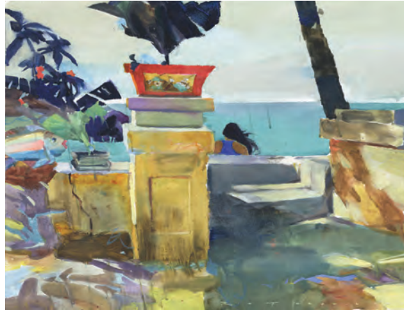
Ron Thurston , Coraopolis, PA Southern Most Agenda $2,000 29" x 35"