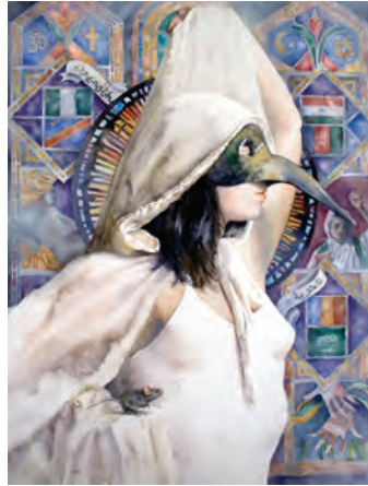
Peggi Habets , Pittsburgh, PA What Plagues Us , $2,400 35" x 28"