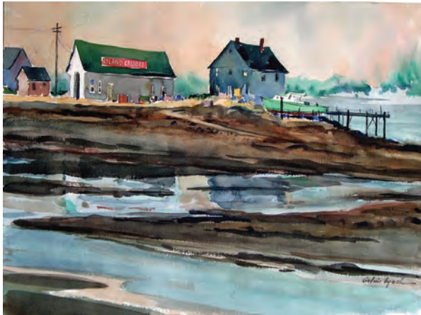
Calvin Lynch , Confluence, PA Tide's Out $950 18" x 24"