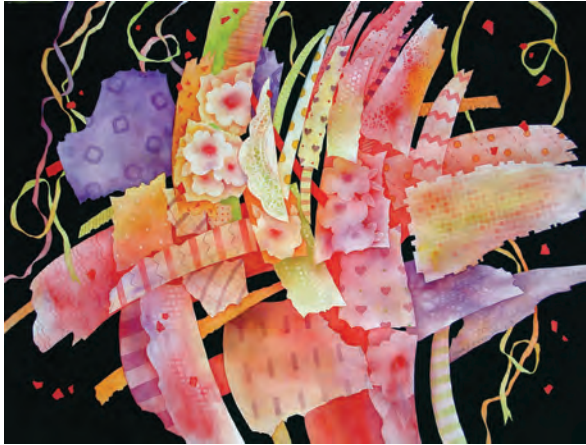
Carol Brody , Wellington, FL Party Papers, Ribbons and Red Confetti , $1,100 22" x 30"