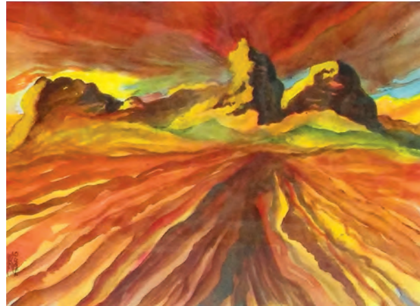
Kathleen Dugan , Monroeville, PA Tetonics , $350 9.75" x 13"