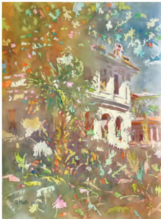
Judi Betts , Baton Rouge, LA Luxury Lives Here , $2,500 30" x 22"