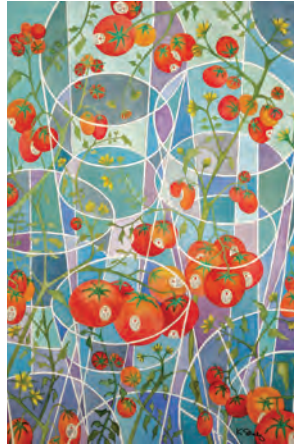
Kathryn Strutz , Mars, PA Storganic $2,500 40" x 30"