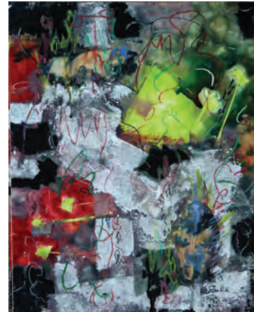
Kathleen Zimbicki , Carnegie, PA When We Were Baptist $1,000 30" x 22"