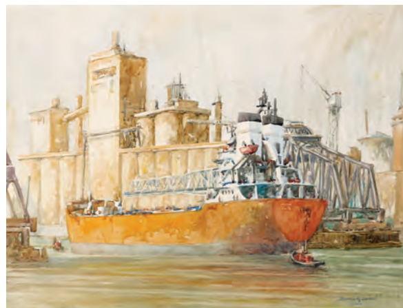
Thomas Sorrell , Sylvania, OH Crossing Paths $1,200 19" x 25"