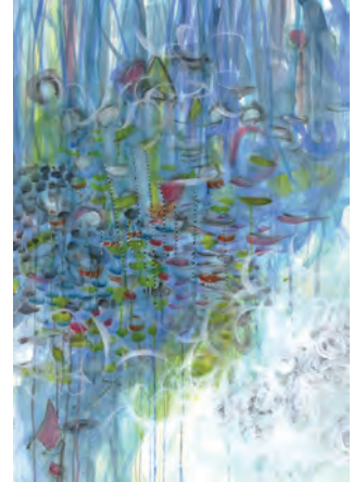
Christine Alfery , Lac du Flambeau, WI Fish in the Reef , $2,200, 40" x 30"