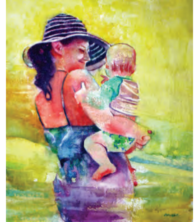
Debra Valentino , Gibsonia, PA Golden $3,400 24.5" x 21"