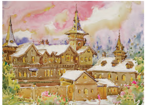
Tan Chye Tiong Ronald , Singapore Fantasy Villa , $3,000 12" x 16"