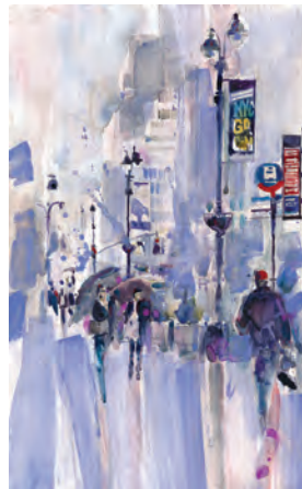
Dorrie Rifkin , Englewood, NJ Purple Rain $750 18" x 12"