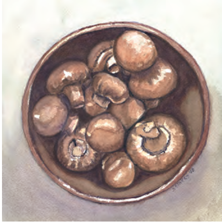
Susan Sparks , Dunlevy, PA Ciotola di Funghi $200 12" x 12"