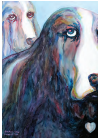
Sim Cha , Pittsburgh, PA 2 Loving Basset Hounds $4,000 38" x 30"