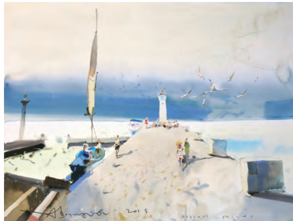
Alexander Votsmush , St. Petersburg, Russia Drawing Girls $5,000 23.5" x 31.5"