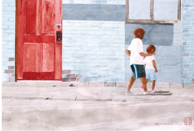
James Lefebvre , Eaton, OH Bro $1,000 14.5" x 21.5"