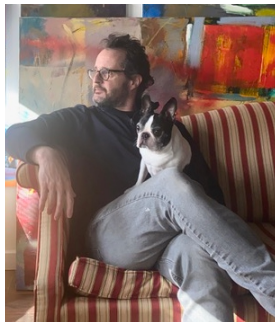
Scott merges his love of abstract expressionism with figuration, completing two distinct bodies of work. His work evokes specific places or memories that resonate with emotional presence.

Scott’s instruction for this workshop will focus exclusively on his abstract painting techniques, and these questions will be addressed: Why paint non-objectively? What makes an abstract painting good? Can anybody paint abstractly? Participants will use different materials, tools, surfaces, and textures as they learn to embolden their use of color and develop the language of mark making. It is expected that all will leave the workshop with fresh ideas on how to ignite their own painting practices. Every skill level is welcome but some familiarity with use of water media is expected.