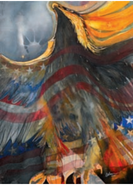
DONALD NELSON Beaver, PA "Out of the Ashes" 30x37 $3,000