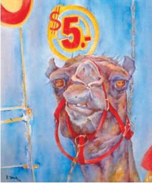
KATHRYN STRUTZ Mars, PA "The Cost of Diesel" 30x30 $1,200