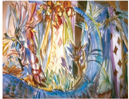
VAL WRIGHT Naples, FL "A Simple Plan" 36x28 $1,000