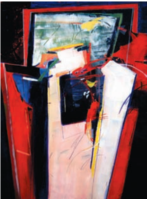
DENISE ATHANAS Mt. Pleasant, SC "Window to the Future" 30x38 $1,800