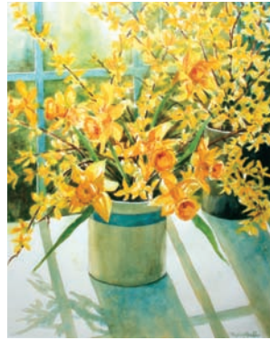
PHYLLIS KOEHLER Mt. Pleasant, PA "Spring Floral" 24x28 $850