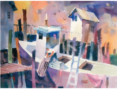
FRANK WEBB Pittsburgh, PA "Port Clyde" 36x28 $1,500