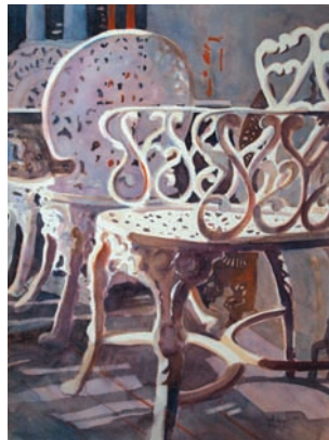
NEL DORN BYRD

Poway, CA "Morning Stroll In EDFU" 36x28 $2,600