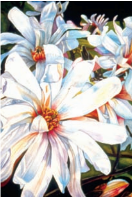
MISSI PAUL Lincoln, NE "Magnolia Vivace" 31x39 $2,200