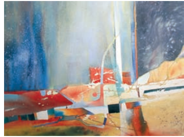
BARRY WINSAND Pittsburgh, PA "Planetarium" 30x23 $450