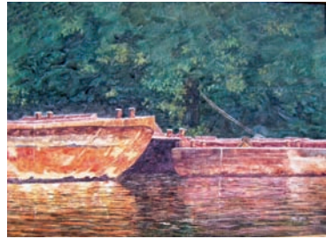
MARY LOIS VERRILLA Pittsburgh, PA "Quiet Reflections" 27x20 $1,200