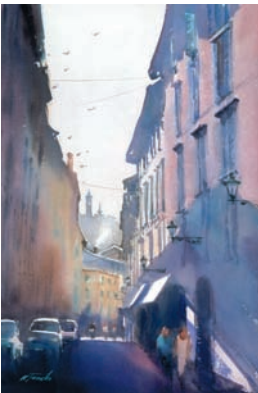
KEIKO TANABE San Diego, CA "Bergamo VIII" 22x28 $1,350