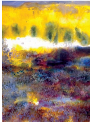
PAT SAN SOUCIE

Sylvania, OH "Pacific Grove Light" 26x20 $500