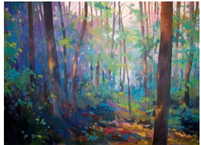
CHRISTOPHER LEEPER Canfield, OH "Evening Tranquility" 47x33 $3,000