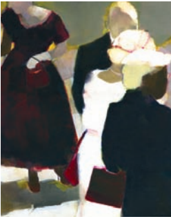
JEANNIE McGUIRE Pittsburgh, PA "The Occasion" 22x27 $1,500