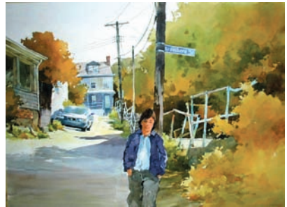
WILLIAM M. VRSCAK Pittsburgh, PA "South Side Kid" 37x29 $1,600