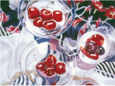
CAROL HUBBARD Monroe, CT "Cherry Wine" 35x27 $4,000