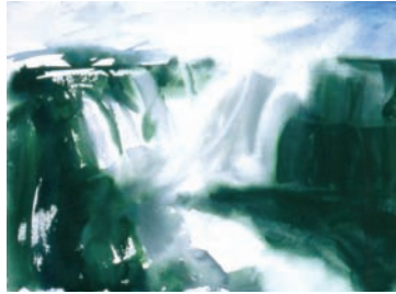
ESTELLE McFARLAND BYRNE Pittsburgh, PA "Iguassu Falls" 30x24 $1,000