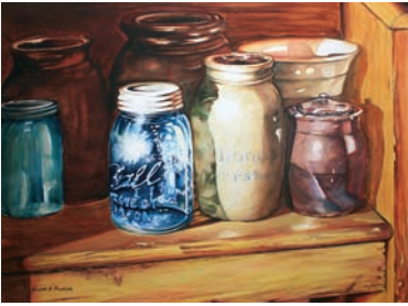
KENNETH W. WADDELL Belington, WV "Light, Shadow, and Reflection" 32x26 $950