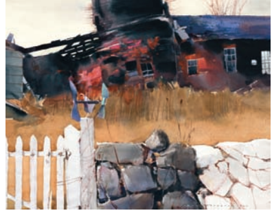
RON THURSTON Pittsburgh, PA "Water Repeler" 34x29 $1,200