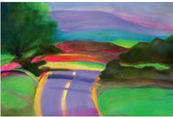
MONICA WILKINS Morgantown, WV "Country Road" 27x19½ $900