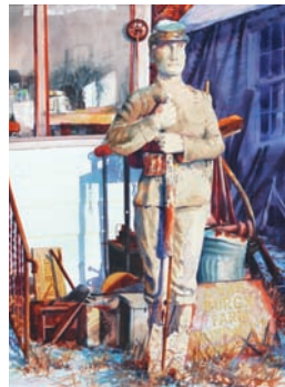
WILLIAM T. PERRY Harmony, PA "Standing Watch" 29x36 $2,000