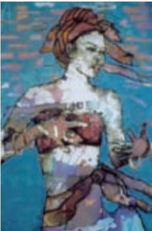
#36 MARIANNE MARINO Allison Park, PA "Drumbeat" 23x32 $1,000