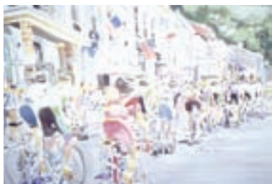
#55 GAYLE TYSON Malvern, PA "The Wall" 18x24 $400