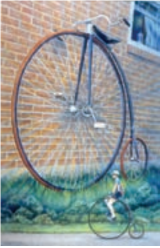
#42 EILEEN NEILL MUELLER Riverwoods, IL "High Wheeler" 28x38 $4,000