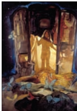
#27 RUSSELL JEWELL Easley, SC "Cocoon" 28x35 $1,600