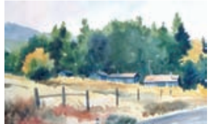
#15 BILL DOYLE Green Bay, WI "Pine Creek, MT" 21x28 $600