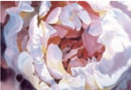
#44 ANN PEMBER Keeseville, NY "Ode to Joy" 22x28 $1,200