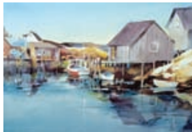
#20 DON GRAEB Glenshaw, PA "Peggy's Cove" 22x29 $1,400