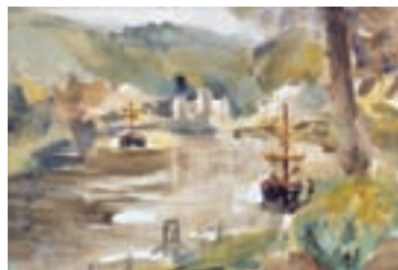
#6 JACQUELINE BOULOUFFE Brussels, Belgium "Old Time Transport" 19x24 $600