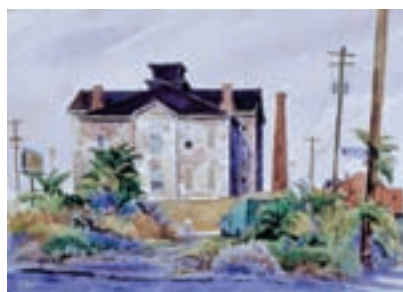
#35 CALVIN LYNCH Pittsburgh, PA "Old Springfield School" 20x26 $1,400