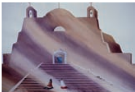
#2 GLORIA BAKER Evansville, IN "Door of the Spirit" 28x36 $2,200