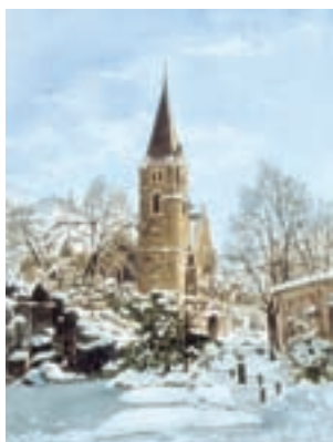
#26 BARBARA JEWELL Export, PA "Mountain Sanctuary" 18x22 $1,000