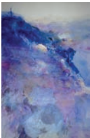
#48 LUELLA PRIORE Coraopolis, PA "Blue Mountain" 30x38 $1,200