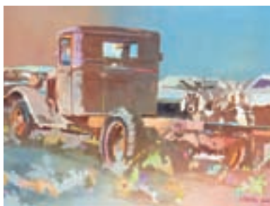
#3 JUDI BETTS Baton Rouge, LA "Four On The Floor" 31x39 $2,300