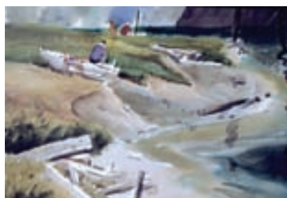
#23 JOHN W. HEWITT Clearlake, CA "Albion Flats" 22x30 $600