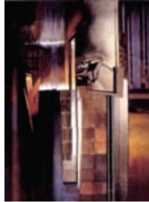
#14 H.C. DODD Houston, TX "Blues II" 28x36 $1,950