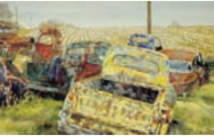
#43 KIT PAULSEN Washington, PA "Studebakers" 26x35 $850