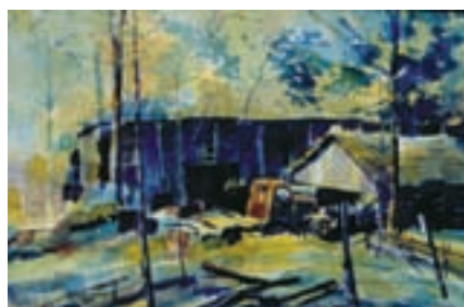
#52 ROLAND E. STEVENS, III Pultneyville, NY "Tennessee Farm" 24x30 $850