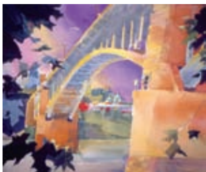
#54 RON THURSTON Pittsburgh, PA "Polish Hill" 27x29 $1,200