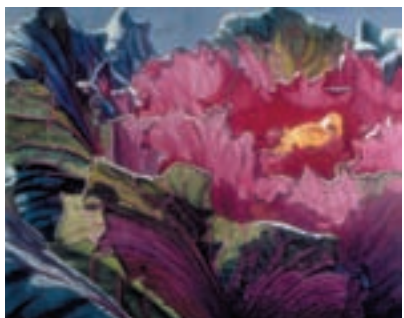
#56 DEBI WATSON Lancaster, PA "Revolution" 32x36 $1,200