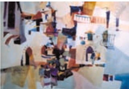
#12 RATINDRA DAS Wheaton, IL "Music In Stone" 28x36 $2,000