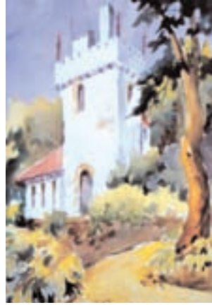
#45 BETTY PHILLIPS Aliquippa, PA "The Castle" 16x20 $350