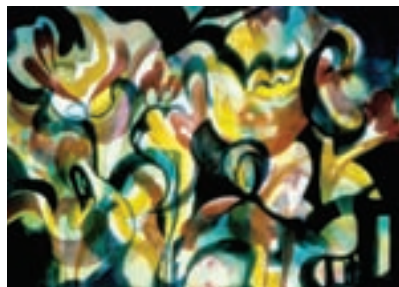
#7 NANCY BUSH Moon Township, PA "Tip-Toe Through The Tulips" 30x38 $800