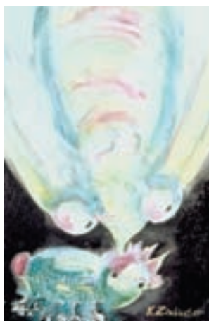
#59 KATHLEEN ZIMBICKI Carnegie, PA "Dive Bombing" 22 x28 $700