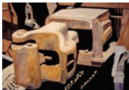
#22 DONALD HARVIE Stockton, CA "Coupling" 28x36 $1,300