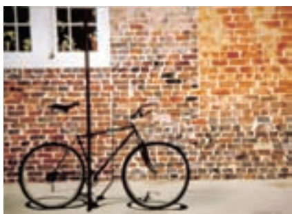
#32 JAMES R. LEFEBVRE East Liverpool, OH "Back in Five" 27x35 $1,600