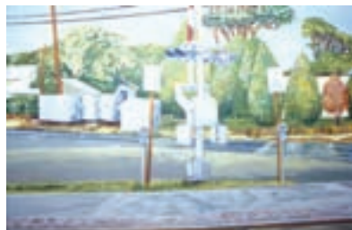
#8 MICHAEL COHEN Long Beach, NY "The Warwick Crossing" 23x28 $1,500