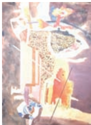
#34 GUY LIPSCOMB Columbia, SC "Gabriels Gate" 29x39 $1,400