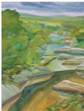
#58 BARRY WINSAND Pittsburgh, PA "Slippery Rock Creek" 30x38 $750