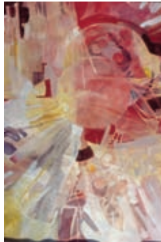
#46 SUSAN E. POLLINS Greensburg, PA "Connect: Red" 19x25 $795