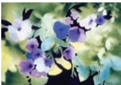
#57 JEAN WEST Pittsburgh, PA "Lavender Lovelies" 30x38 $1,000