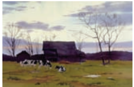
#47 JOEL POPADICS Wayne, NJ "Last Light" 30x36 $2,500