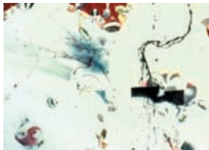
#5 BRUCE BOBICK Carrollton, GA "Bean-Devouring Snails, or Wombs Used To Be Such Safe Places" 37x48 $2,000