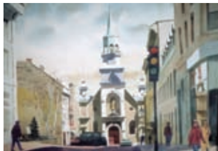
#29 HOWARD KAYE Lincoln, NE "Montreal Church" 27x35 $1,500